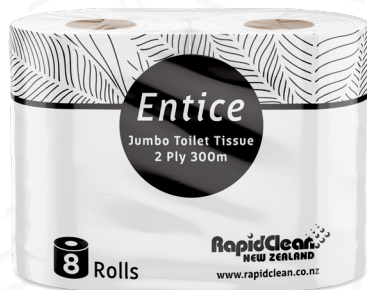
JUMBO TOILET TISSUE ROLL