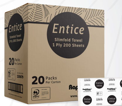
SLIMFOLD HAND TOWEL