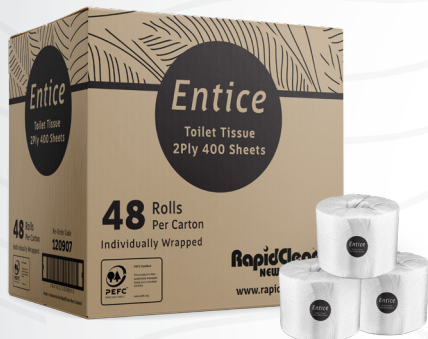
TOILET TISSUE ROLL